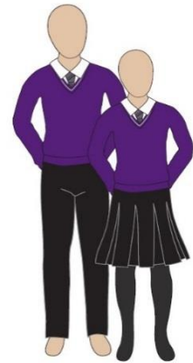
Years 7 - 9

At the Kingswood Secondary Academy we enforce our strict uniform policy rigorously. We believe that wearing our distinctive uniform gives our students a sense of belonging, helps foster pride in the Academy and stops students coming to school in inappropriate clothing or footwear. Students are our ambassadors in the community. Therefore, we expect all students to wear full uniform when travelling to and from the Academy, at all Academy functions, on extra-curricular visits and when taking part in sports events.